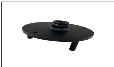
Adapter for handwheel