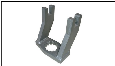
Special reaction arm