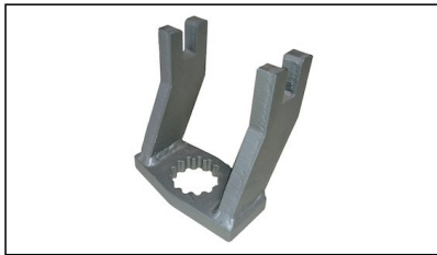
Special reaction arm